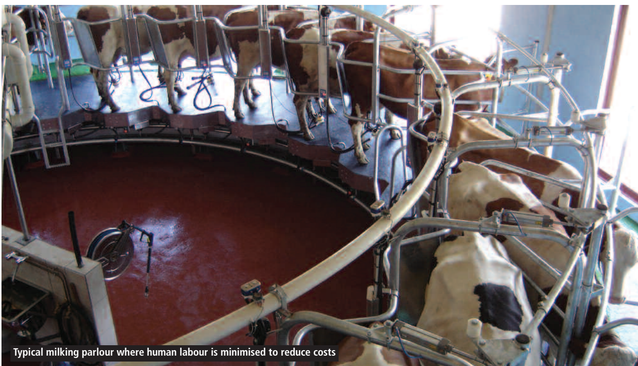
Typical milking parlour where human labour is minimised to reduce costs

The Welfare of Animals at Markets Order 1990 prohibits an animal being exposed for sale in a market if she is likely to give birth while she is there, as well as The Welfare of Animals (Transport) Order 1997 which states that animals likely to give birth must not be transported (97). Despite these laws, and the well-established fact that the stress of transport and the market itself may induce labour or abortion, the FAWC highlight the continuing problem of pregnant animals being brought to market in their report (97).