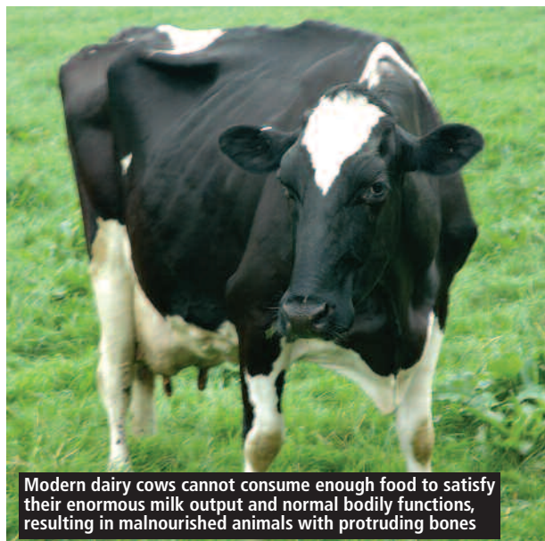
Modern dairy cows cannot consume enough food to satisfy their enormous milk output and normal bodily functions, resulting in malnourished animals with protruding bones

Due to their inability to meet the metabolic demands of lactation, it is normal for cows to 'milk off their backs' in early lactation (draw on body reserves), resulting in a 'coat rack' appearance with the bones of the hips and spine protruding (8, 37). Dairy farmers consider this to be a normal metabolic situation in high-yielding dairy cows and have come to accept 'bony' dairy cows as typical, when in fact they are malnourished (79).