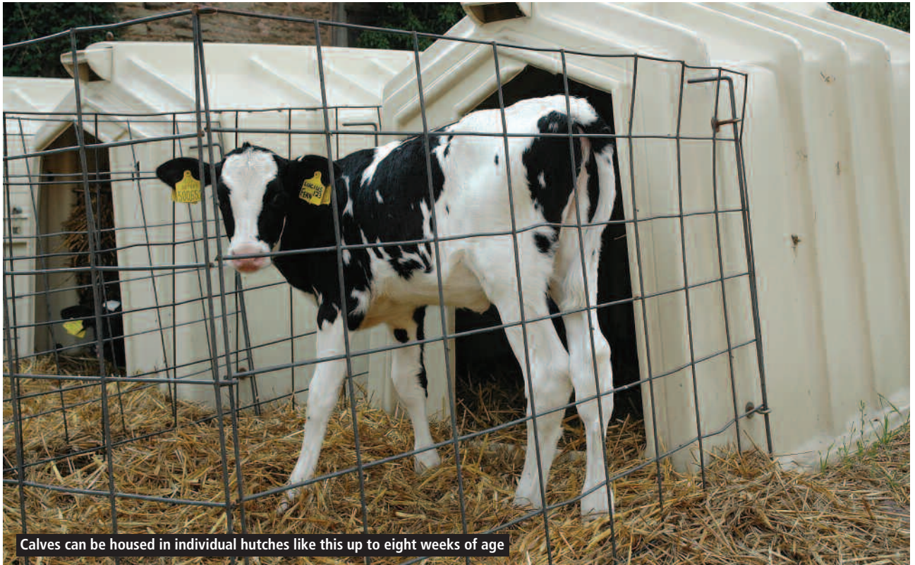
Calves can be housed in individual hutches like this up to eight weeks of age

pneumonia – the most common disease of weaned calves (40, 58). Essentially, it is impossible to artificially rear calves in a way which fulfils their natural needs and behaviours without compromising their health.