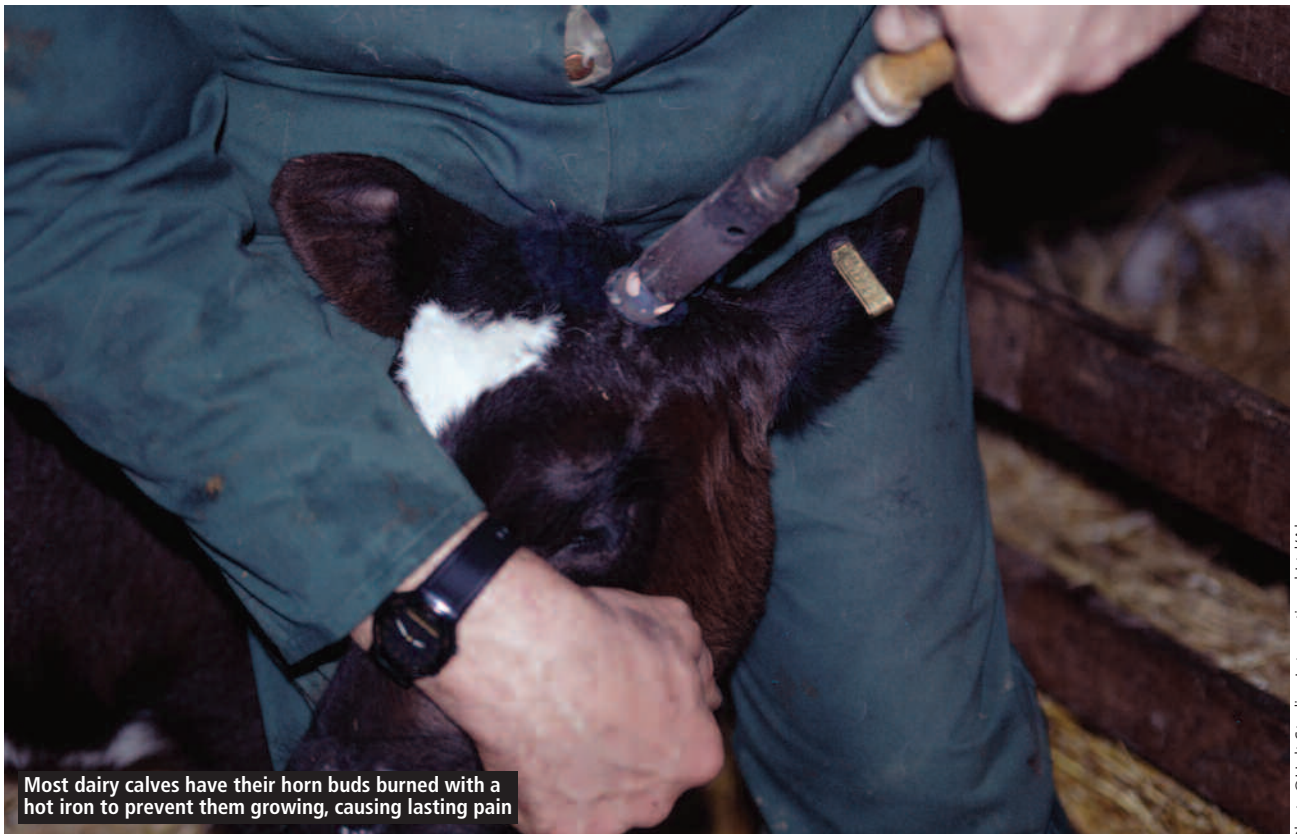
Most dairy calves have their horn buds burned with a hot iron to prevent them growing, causing lasting pain