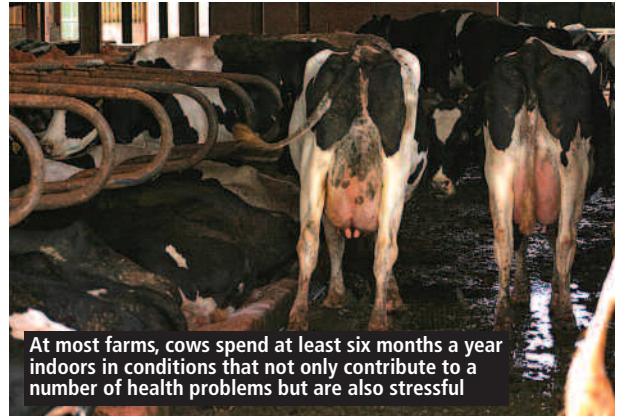
At most farms, cows spend at least six months a year indoors in conditions that not only contribute to a number of health problems but are also stressful

High protein concentrates cause a build up of toxins in the cow's system which often cause the severely painful condition laminitis (inflammation of the tissue which lies below the outer horny wall of the foot) (8, 41, 42). When there's too much concentrate in the diet or too much of it is fed at once, it causes lactic acid accumulation which leads to a change in metabolism and a change in bacteria in one of the stomachs (rumen). This condition is called acidosis – which means there's too much acid in the body, more than the body can cope with. When lactic acid is absorbed into the bloodstream it upsets the cow's metabolism and affects blood circulation reducing blood supply to the feet (41). And because the increased acidity of the rumen also kills some of the bacteria that naturally live there, their decay produces toxins which are absorbed into the blood stream and can cause permanent damage to blood vessels (41).