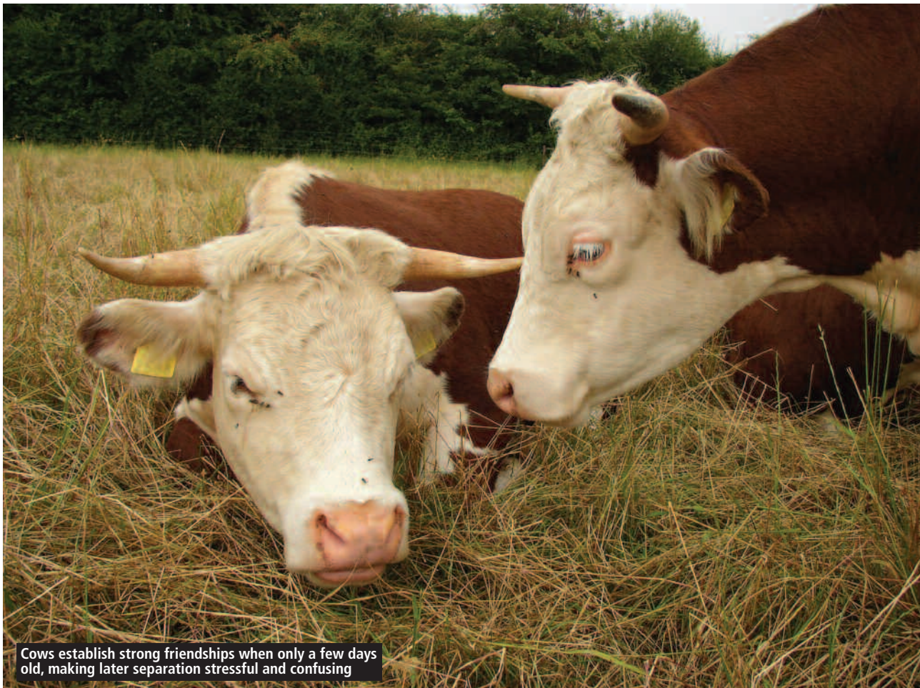
Cows establish strong friendships when only a few days old, making later separation stressful and confusing

Cattle have excellent hearing and hear sounds at similar and higher frequencies to humans; they dislike loud, sudden noises. They also have a very effective sense of smell which they use to explore new objects or environments.