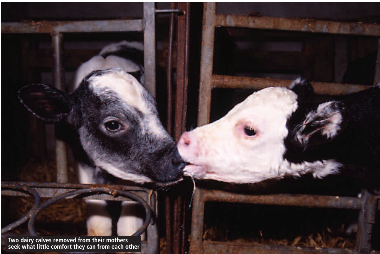
Two dairy calves removed from their mothers seek what little comfort they can from each other

Although the veal crate was banned in the UK in 1990 due to the immense cruelty involved, the UK