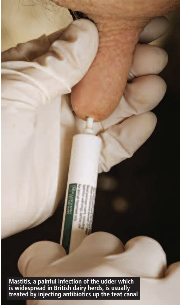
Mastitis, a painful infection of the udder which is widespread in British dairy herds, is usually treated by injecting antibiotics up the teat canal