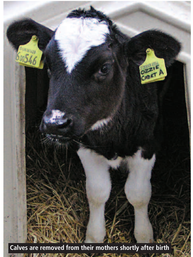
Calves are removed from their mothers shortly after birth

Although a cow would naturally suckle her calf for nine months to a year, calves born on dairy farms are taken away from their mothers within a few days of birth (8, 29) – so that we can drink the milk that was meant to nourish the calf. A strong mother/infant bond is formed between cow and calf within the first few hours of birth, making their separation extremely traumatic (34). Both the cow and calf