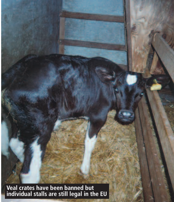
Veal crates have been banned but individual stalls are still legal in the EU

still produces veal. The majority of calves are raised for rose veal. Rose veal production differs from white veal in that calves may only be kept in individual stalls until eight weeks old, rather than the 16-20 weeks for white veal, after which they must be group housed (8, 67). From birth, calves must be fed a diet which contains sufficient iron to avoid anaemia (8, 67) and from two weeks of age they must be provided with a daily ration of fibrous food to allow normal rumen development (rumen is one of a cow's stomachs).