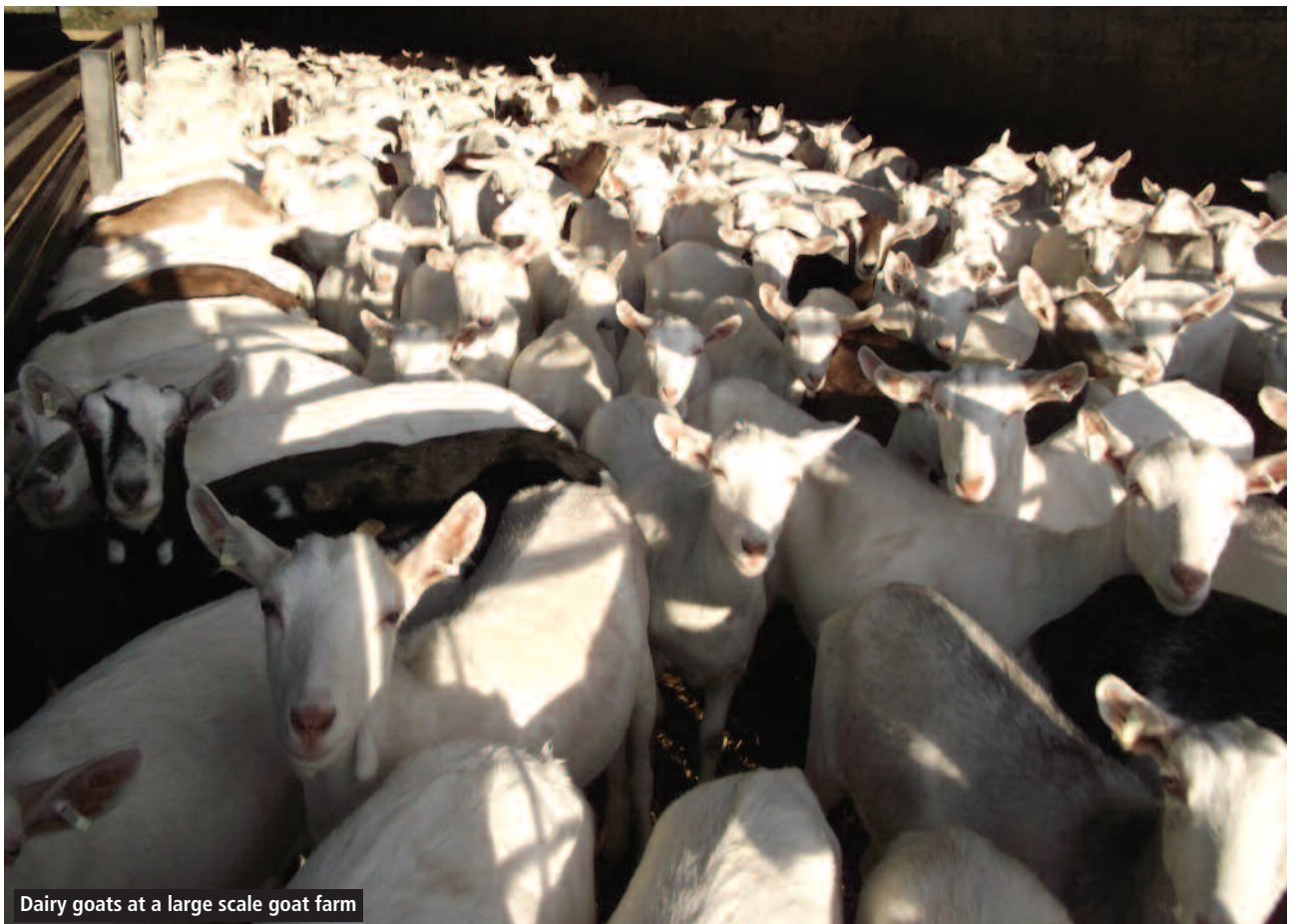
Dairy goats at a large scale goat farm

Some reports have said that the market for goat dairy products is increasing by 20-30 per cent a year