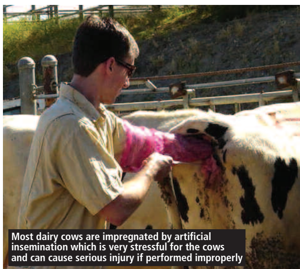
Most dairy cows are impregnated by artificial insemination which is very stressful for the cows and can cause serious injury if performed improperly

Embryo collection: 'high quality' cows are given a treatment to increase ovulation and then artificially inseminated in the usual manner (45). The resulting embryos (usually between seven and 12) are flushed from her uterus using a catheter type instrument (45). As this procedure takes place a week after oestrus (ovulation), the uterus is more difficult to penetrate than during artificial insemination and can result in bleeding and sometimes even uterine rupture (45). The procedure is so painful that UK law requires the use of an epidural (53).