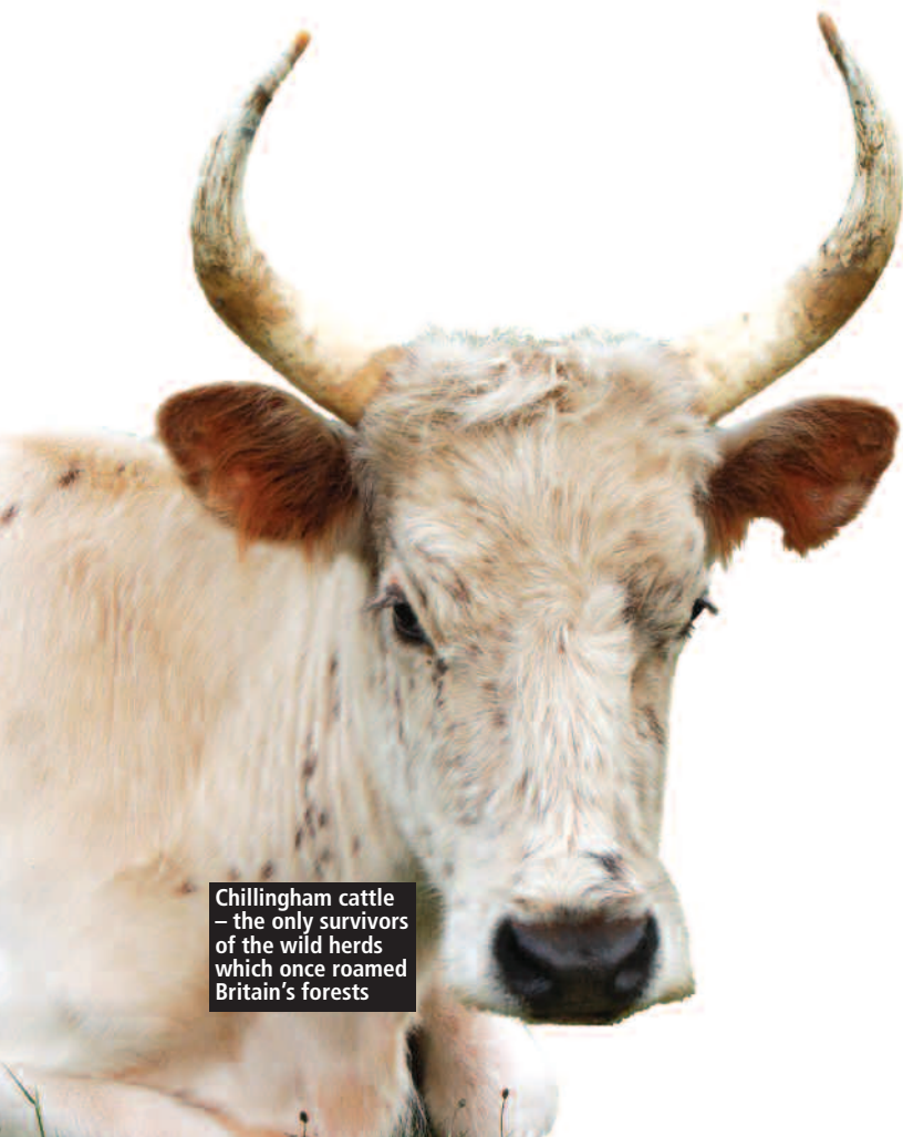
Chillingham cattle – the only survivors of the wild herds which once roamed Britain's forests

Cows are very protective of their young and will attack, and even kill, anything they see as a threat. Female calves will naturally suckle until they are around nine months old and stay with their mothers for the rest of their lives (29, 30). Males are weaned at around 12 months old and would then leave the herd and join a bachelor herd (29). Both males and females can easily live to be 20 years old (28, 29, 30).