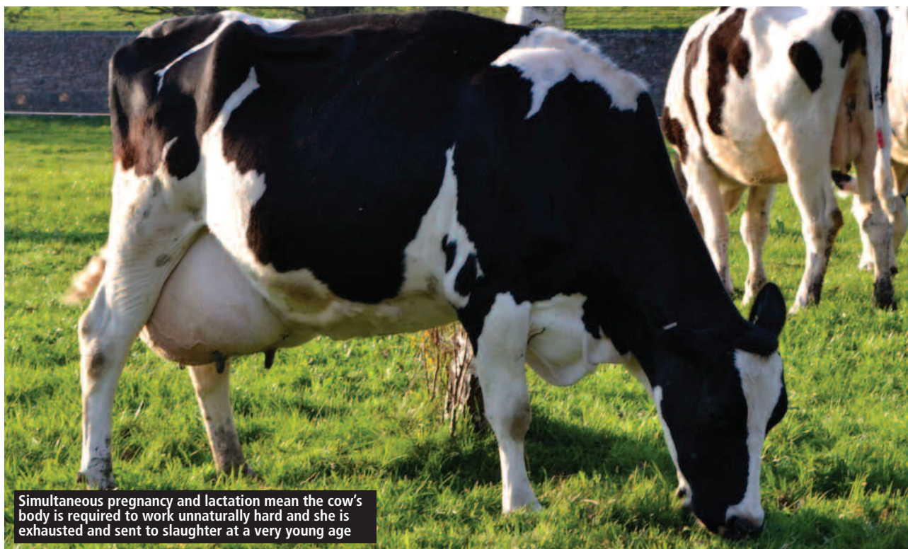
Simultaneous pregnancy and lactation mean the cow's body is required to work unnaturally hard and she is exhausted and sent to slaughter at a very young age

Because of the huge pressure this puts on the cow's body, the average dairy cow in the UK completes less than four lactations (31) – that means that around the age of six, she is slaughtered because she stops being profitable (either because of low milk yield, infertility or diseases that would require costly treatment) (5, 31).