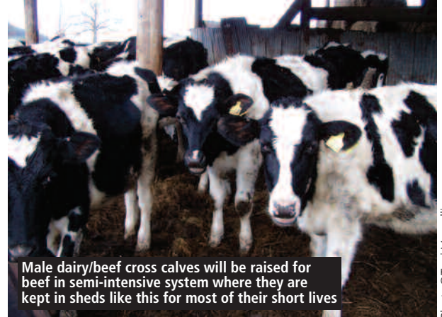
Male dairy/beef cross calves will be raised for beef in semi-intensive system where they are kept in sheds like this for most of their short lives

In January 2007 veal crates were banned across the EU and since this date, EU veal production came in line